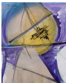
In the Heat of Summer , Dorothy Doherty, Acrylic on paper, 2013, 16" x 20", $195