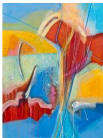
Blue Rondo , Dorothy Doherty, Acrylic and oil on canvas, 2012, Right panel, 40" x 30", $2050