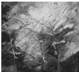
Genus Equisetum I , Dorothy Doherty, Conte and charcoal on Mylar, 2010, 36" x 40", $3000