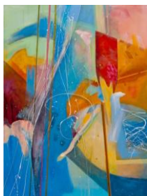
Blue Rondo , Dorothy Doherty, Acrylic and oil on canvas, 2012, Left panel, 40" x 30", $2050