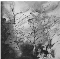
Genus Equisetum II , Dorothy Doherty, Conte and charcoal on Mylar, 2010, 36" x 38", $3000