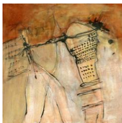
Somewhere in Syria , Dorothy Doherty, Acrylic on paper, 2013, 12" x 12", $250