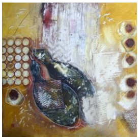
Generations , Dorothy Doherty, Mixed media on panel, 2015, 30" x 30", $450