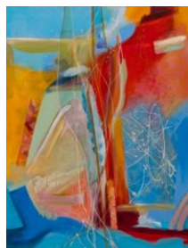
Blue Rondo , Dorothy Doherty, Acrylic and oil on canvas, 2012, Middle panel, 40" x 30", $2050