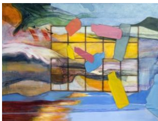
Passages , Dorothy Doherty, Acrylic and oil on canvas, 2012, 30" x 40", $495