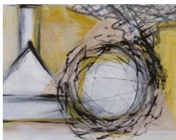
Vortex Rings , Dorothy Doherty, Acrylic on paper, 2013, 16" x 20", $195