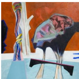
The Dromedary , Dorothy Doherty, Acrylic on canvas, 2012, 30" x 30", $450