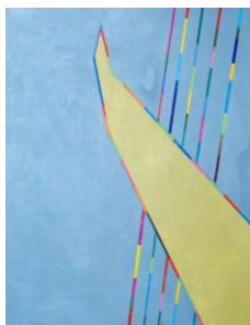
A Night in Milan , Dorothy Doherty, Acrylic on panel, 2014, 26" x 20", $295