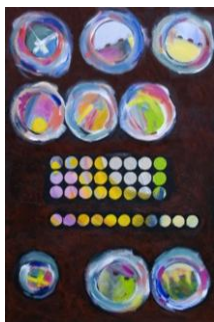
Constellations from a Parallel Universe , Dorothy Doherty, Acrylic on canvas, 2014, 36" x 24", $295