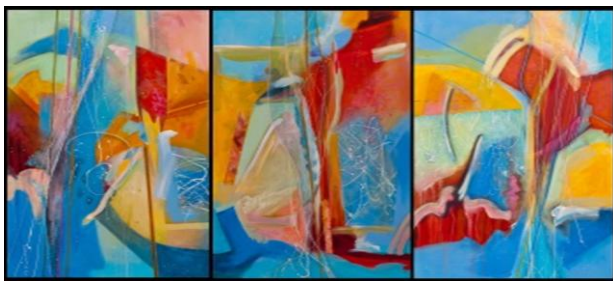
Blue Rondo , Dorothy Doherty, Acrylic and oil on canvas, 2012, Triptych (three panels), 40" x 90", $6150